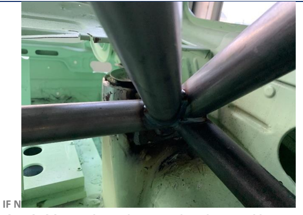
SHOULDER HARNESS ATTACHMENT – DRIVER

O PHOTOGRAPH IS ATTACHED. THE STRUCTURE DESCRIBED